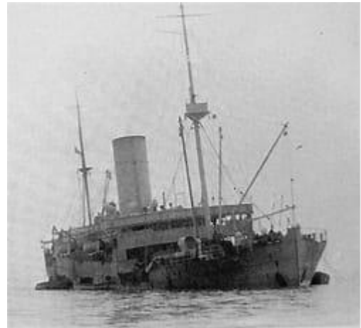
HMS Patia, armed merchant cruiser