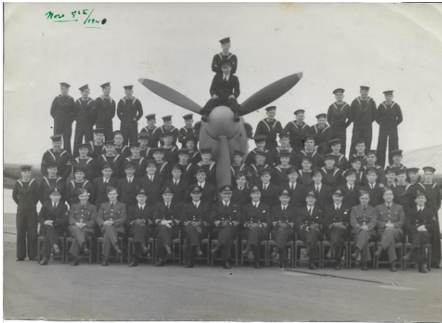
Bert is pictured in row 4 (from the deck) and 2 nd .from the left