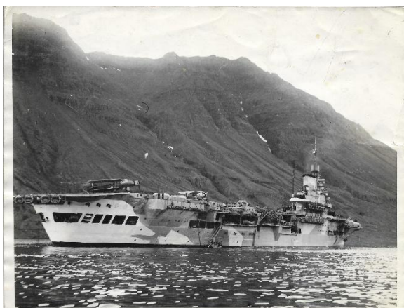
Unidentified ship from Bert's album