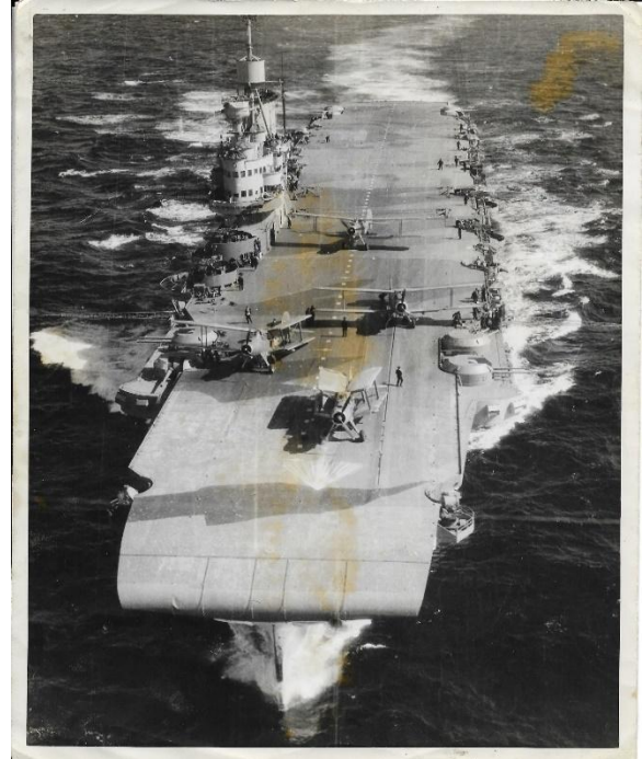
Unidentified aircraft Carrier