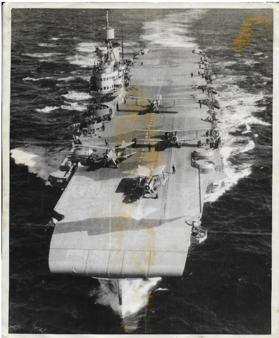
Unidentified aircraft Carrier