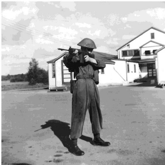
Dressed for a training and range exercise.