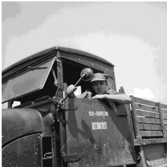
George W Trask Driving a 21/2 Ton truck which was a daily job to pick up food and rations and other supplies. (19