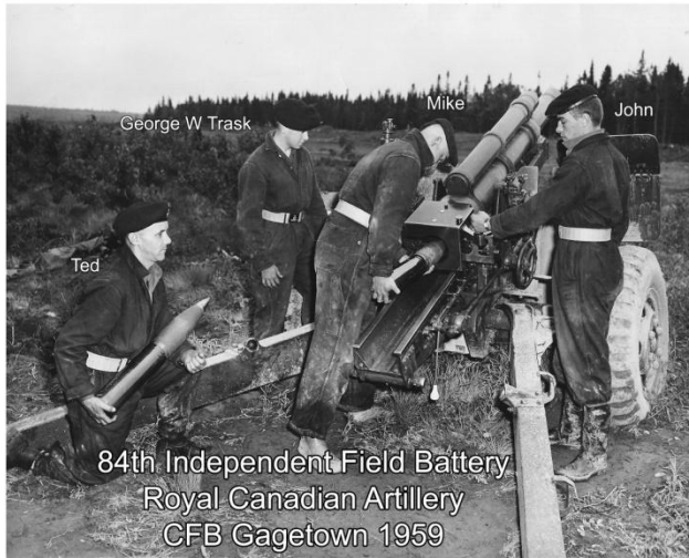
Gagetown during a live fire exercise in 1959.