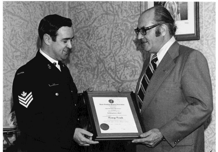
Canadian Humane Association for saving the life of a small girl suffering an electric shock after touching a car while wet from swimming at Still Water, Nova Scotia, 28 th day of August 1975.