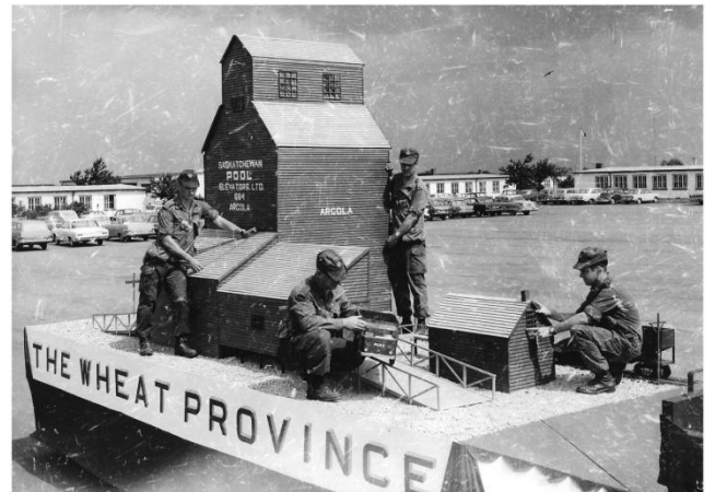
A republic float of a grain elevator which was built for the Canada Day Parade going through the German towns which were involved with the Canadians.