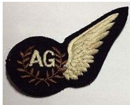
Air Gunner flying badge

Wireless operator/air gunner – The role was to send and receive wireless signals during the flight, assisting the observer with triangulation "fixes" to aid navigation when necessary and if attacked to use the defensive machine gun armament of the bomber to fight off enemy aircraft. In the early stages of the war usually an enlisted man, he could hold any rank from aircraftman 2nd class (until 27 May 1940) [33] upwards but most often a sergeant. A wireless operator/air gunner wore a single-winged aircrew flying badge with a wreath containing the letters AG or S on his tunic, above his left breast pocket denoting his trade specialisation and a cloth arm patch featuring lightning bolts.