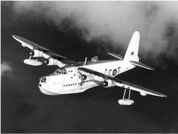
Short Sunderland Mk V