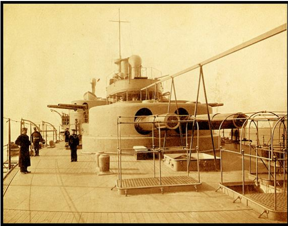
On the fantail looking forward