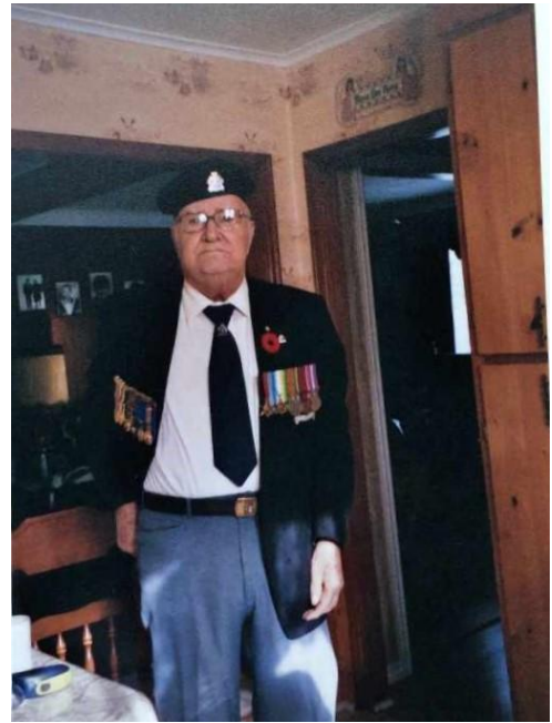
Dad's Last Remembrance Day