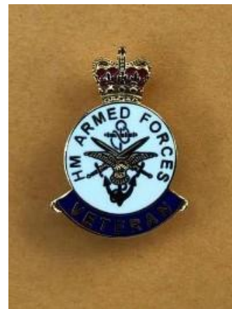
From Queen Elizabeth II