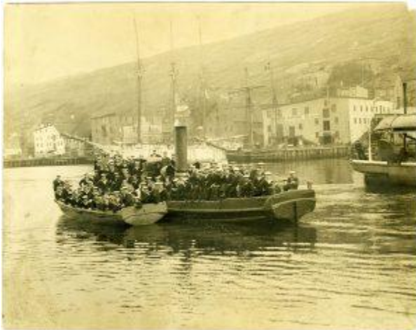
Photo Credit: The Rooms Provincial Archives. A 11-165; Departure of the Newfoundland Detachment to the Great War (Naval Reservists embarking for England, 1914).

Most people associate the memorial at Beaumont Hamel, France with the Royal Newfoundland Regiment but the memorial also pays tribute to the men of Newfoundland and Labrador who served with the Royal Navy .