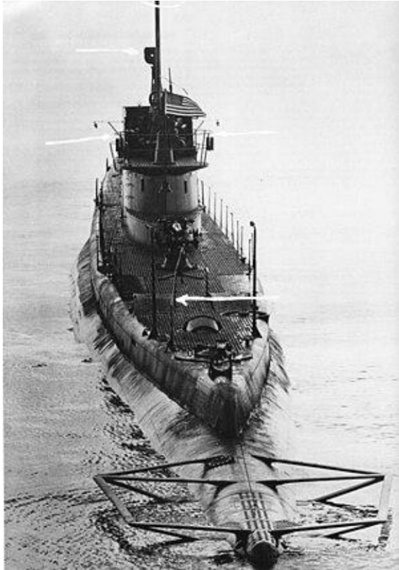
USS Marlin (SS-205)

enlisted on March 22, 1944, and was discharged a year and a half later on October 13 th , 1945. He was assigned to the USNR (United States Naval Reserve) and would be posted to the USS Marlin, a Mackerel -class submarine.