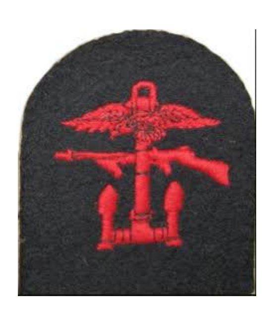
Written by FAMILY

took part in the Invasion of Madagascar, Sicily and D-DAY. He served in North Africa and saw service in Mombasa, Kenya. As a Commando, he was on several raids along the Nordic coasts.