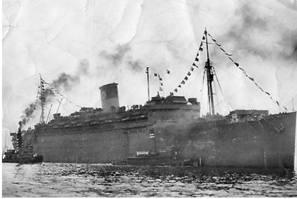
Troopship SS Argentina