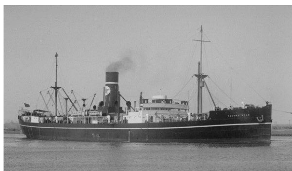
S.S. Tacoma Star