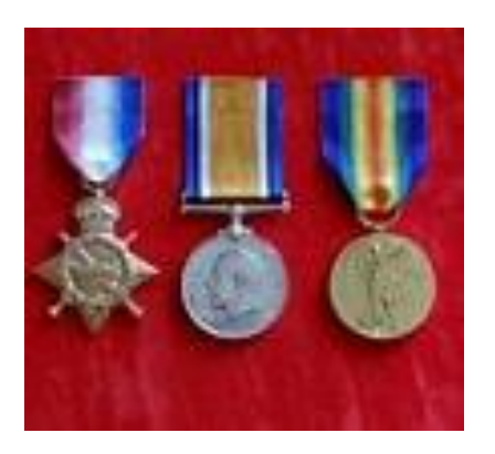
L - R